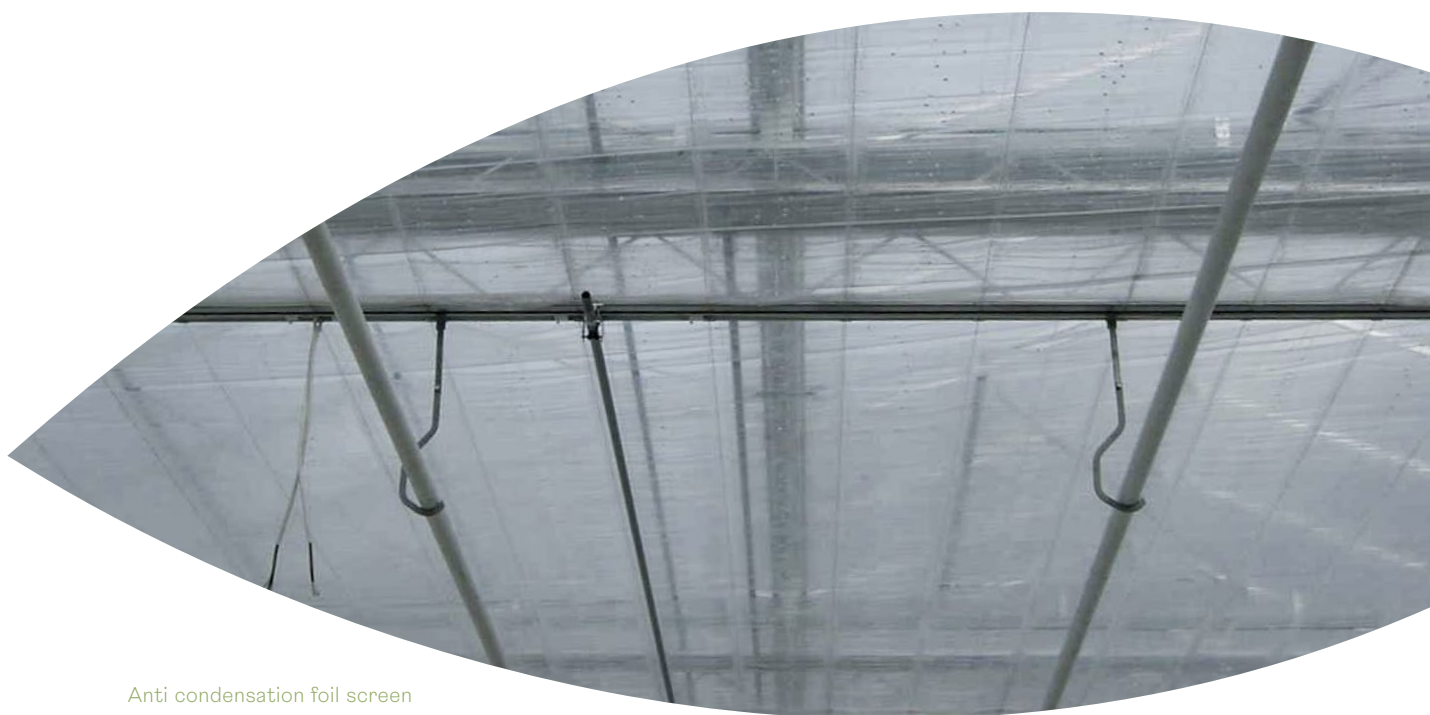
Anti condensation foil screen

In the spring and summer months (depending on the cultivation location), it is essential that the crop grows at the right RH. High-pressure humidification (min. cap. 350 cc/m 2 /hour) is used for this. On very hot days, this can be used to flatten the temperature peak and, if necessary, can also be used in addition to a low-pressure system. A properly functioning humidification system is essential for growers in temperate and warm regions. A disadvantage of a low-pressure system is the fact that the crop gets wet.