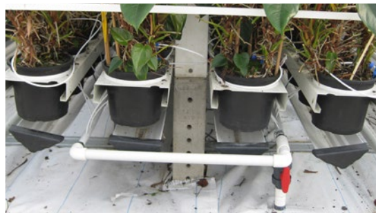
Cultivation in a pot system