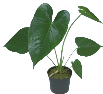
Type 20.1, plants in pots, 20-25 cm