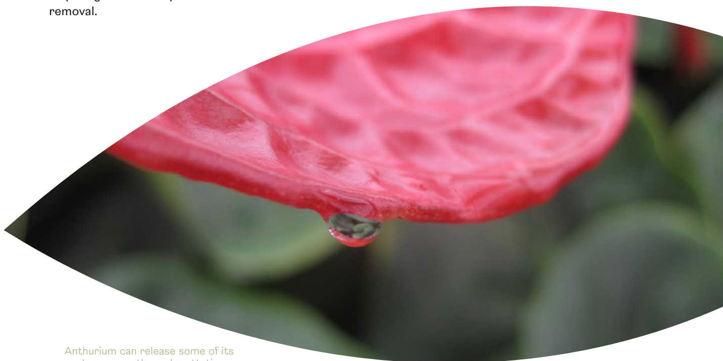
Anthurium can release some of its root pressure through guttation