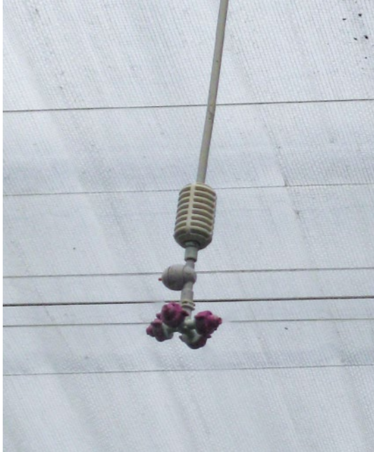
Simple low-pressure humidification

This is especially annoying for employees. During crop work, they often have to work in a rain suit or with a plastic apron. The concrete paths also become wet and slippery.