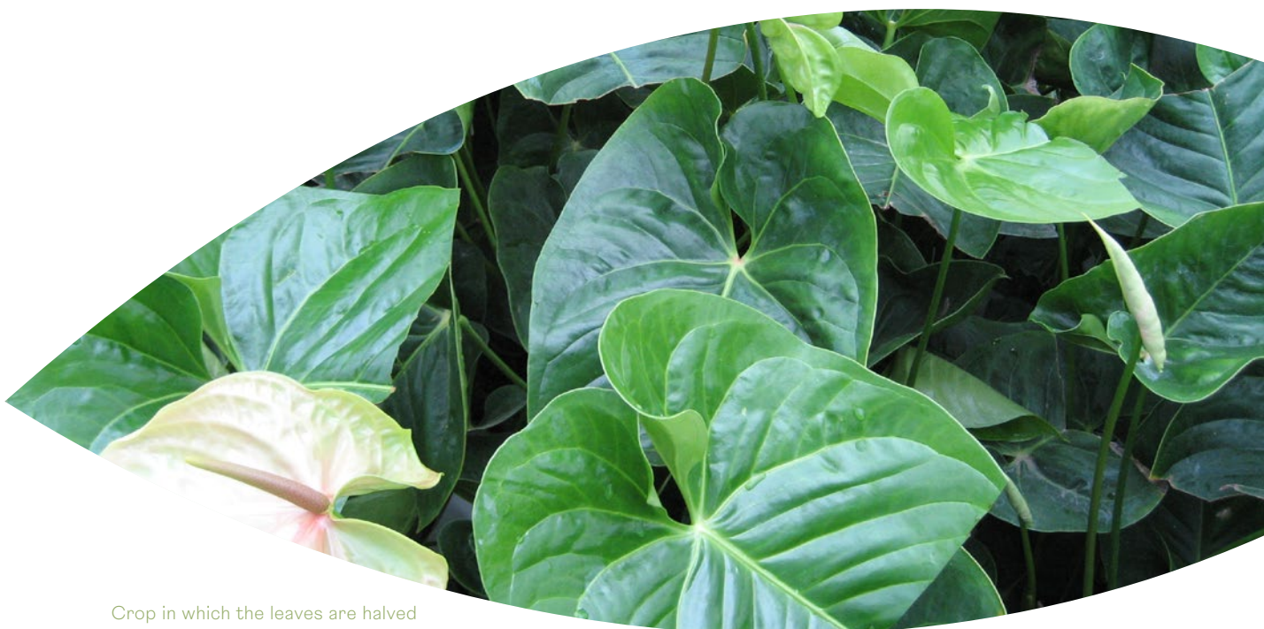
Crop in which the leaves are halved