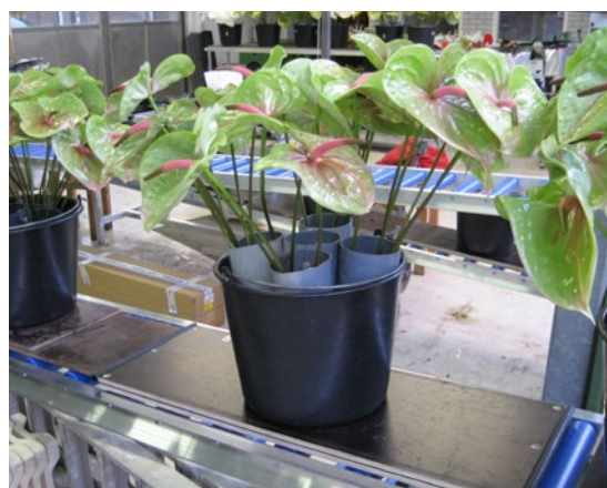
Bucket provided with tubes, wooden plate as spacer