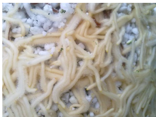
Excellent root growth in perlite

The anthurium grows best in an airy substrate due to its predominantly epiphytic growth habit. The most commonly used substrate types are rock wool cubes (2 x 2cm), perlite 1x perlite weg and oasis.