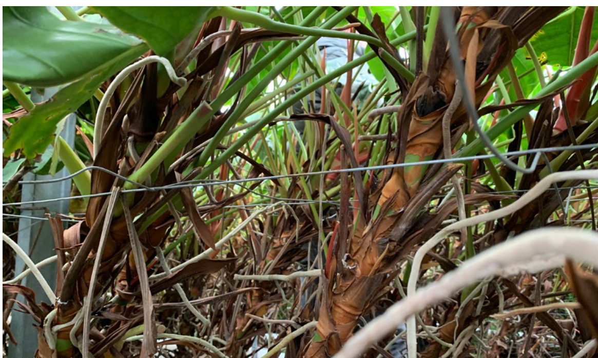
Sloping crop position after turning up the supporting mesh