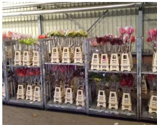
Anthurium with extra long stems

When packing flowers, it is important to find the right balance between speed and quality. It takes several months to train a packaging worker. A worker will pack about 200 flowers per hour on average. The upper limit is close to 220 flowers per hour. Quality comes before speed to avoid complaints from the chain. At a higher number of stems per hour, the risk of damage increases.