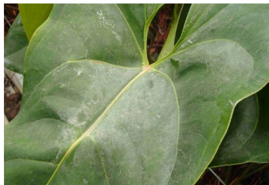
Leaf contamination caused by chalk or nutrient elements from the water

Use clean water such as rain or osmosis water for humidification. When this is not used, the crop and flowers become contaminated with lime or algae deposits.