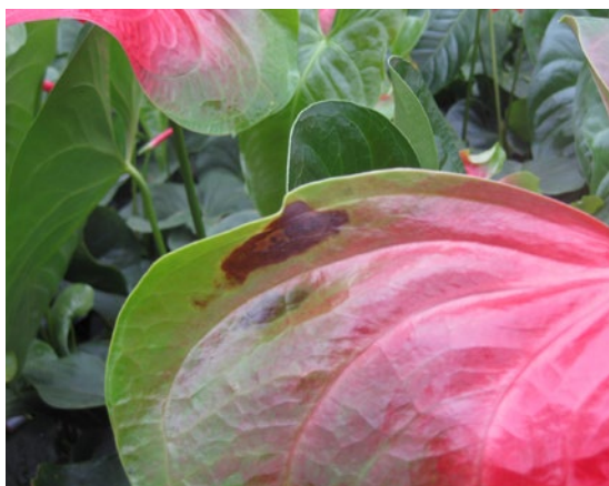
Brown spots caused by calcium deficiency

No ammonium should be given as it significantly lowers the pH. During cultivation, the pH of anthurium already drops significantly by nature. An optimal K:Ca ratio is around 1.2:1.