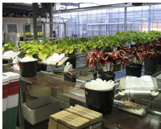
Buffer of roller tracks seen from the packing table