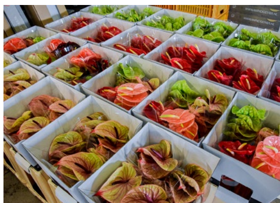
Anthurium packed on water