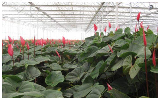
Situation after 2.5 years of cultivation: on the left leaf halving and young leaf breaking and on the right only leaf halving

Young leaf-breaking should be done every week. When leaf breakage goes on too long, flower quality can decrease (less calcium uptake), the flower stem becomes too short, and crop photosynthesis decreases (due to old/yellow leaves). Young leaf breaking can lead to crop acceleration, allowing you to focus on production for the holidays. Be sure to replace or allow new leaves to come through in the appropriate season.