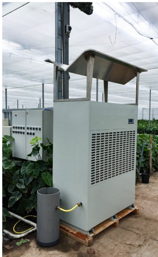
Dehumidifying greenhouse air

Although anthurium can be grown moist, they definitely need basic moisture removal. This can be done by using dehumidifiers in addition to conventional moisture removal (by tube, screen gap, etc.). When these machines are used, water is extracted from the greenhouse air and actually removed from the greenhouse. Drainage of moisture due to higher tube temperatures often actually stimulates evaporation too much, requiring unnecessary additional moisture removal.