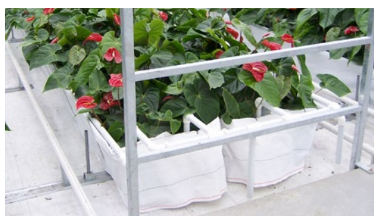
Cultivation in a W-gutter system