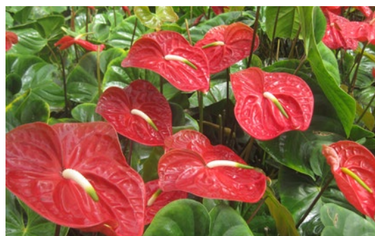
Situation due to combination of leaf halving and young leaf breaking