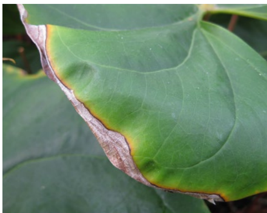
Leaf margins caused by high sodium

Water must be free of chemicals, visible contamination, and diseases. Elements like sodium and chlorine should stay below 4 mmol/litre, and bicarbonate levels ( \text{HCO}_3^- ) should not be too high either (<6 mmol/l). In the absence of optimum water, water partially treated by osmosis must be used.