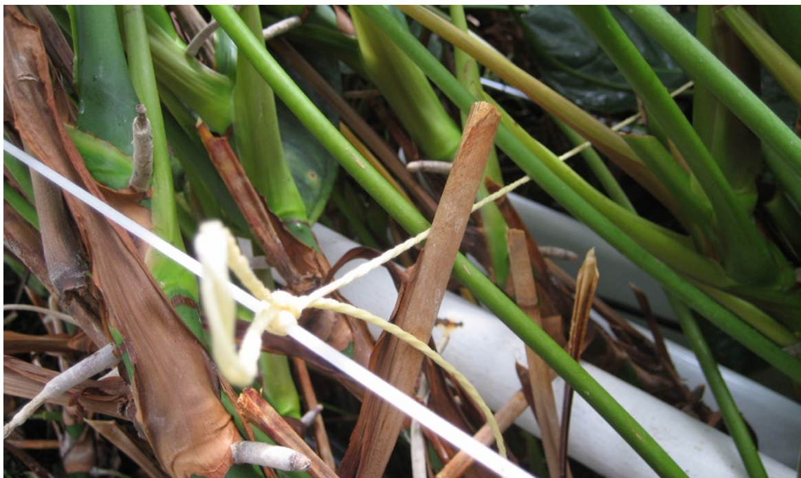
Crop steering by means of cross-wires

After 3-4 years of cultivation (depending on the cultivar), the crop starts falling over. To manage this, timely training is needed. These days, this is mostly done by the intermediate wire system. Further optimization of crop training is now also done with an intermediate wire in the middle of the crop or with mesh.