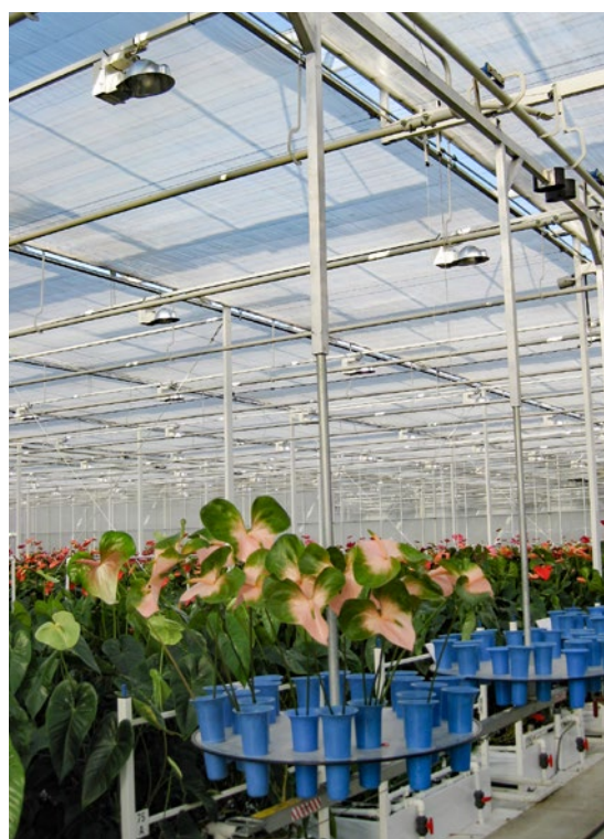
Hanging harvesting system in combination with the upper net of the heating

When the flowers are cut, they are transported to the shed using harvesting systems. Usually, harvest carts with a mast are used, which is fitted with a carousel with harvest vases on both sides. In the shed, the flowers are then manually sorted by size. By means of an internal transport system, the packing stations are fed with a constant supply of anthurium cut flowers.