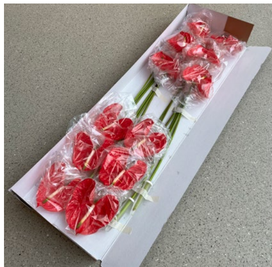
Packaging method Europe

The packaging method depends on what the market prefers. The main packaging method is the single-use auction box. The stems are cut at an angle at the packing stations and provided with a bottle of water. The flowers (bract) are then fitted with a transparent plastic bag and the flowers are packed individually, by sticking them to the bottom of the box. For now, this is largely a manual process. Depending on the diameter of the bract, a box can take 8, 10, 12, 16 or 20 flowers. The most common diameters are 11-13 cm (16 per box) and 13-15 cm (12 per box). It is also possible to pack the flowers in a flow pack. This is usually done at the request of the buyer and depends on the market. For air export, the flowers are also glued to the inside of the lid. Of course, this is customized and only upon request.