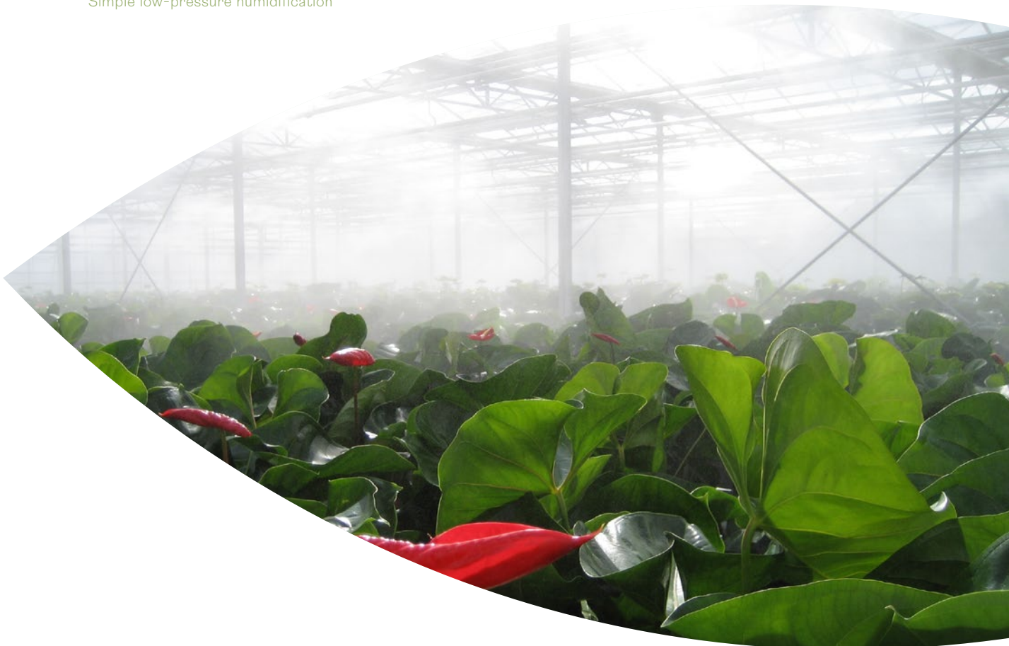
Fog in the greenhouse through high-pressure fog system

The heating system generally consists of a pipe/ rail system. Most growers also use an upper net. The upper net can be used for internal transport. For both networks, it should be possible to control them independently. The lower net consists of eight tubes in an 8-metre grid and the upper consists of four tubes.