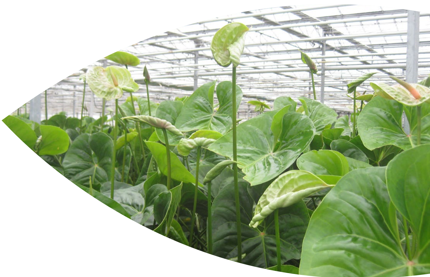
Ideal lighting into the crop using young leaf breaking method

This system starts with halving the new leaves around 4-6 months after planting the young plants. The advantage of this system is that the crop architecture improves considerably. Thanks to the half-leaf system, more light falls on the crop and both production and quality are improved. Depending on the variety and the size of the leaf, the plants will have 4-8 half-leaves before the old lower leaves have to be removed. Leaf tearing is done every 10-14 days.