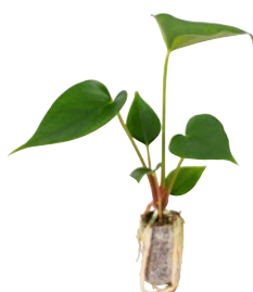
Type SP1, paperplug, 7-12 cm

All plugs and pots are supplied with one plant per plug or pot, unlike anthurium pot plants. With one plant per plug or pot, the plants have more space during the growing phase and are more uniform. This results in high quality and production. In addition, cultivation operations such as leaf cutting become easier. Since the plants grow regularly and all plants are separate, this gives a much more manageable crop, that significantly reduces labour costs.