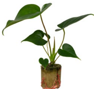
Type 6SP1, rock wool plug, 13-20 cm