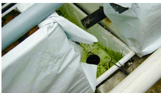
Drainage of a cultivation bed

Too steep a slope can cause drying out at the head of the bed and results in a wet substrate at the lowest point. Moreover, the irrigation system will empty at the lowest point, which will also lead to an overly wet substrate. Keep to a slope of at least 0.05 percent (= 5 cm per 100 metres). When a greater incline is required, extra measures need to be taken with respect to the irrigation system. Depending on regulations, recirculation of drain water is mandatory. It is recommended that drain water is recirculated and disinfected by a UV unit or a heater.